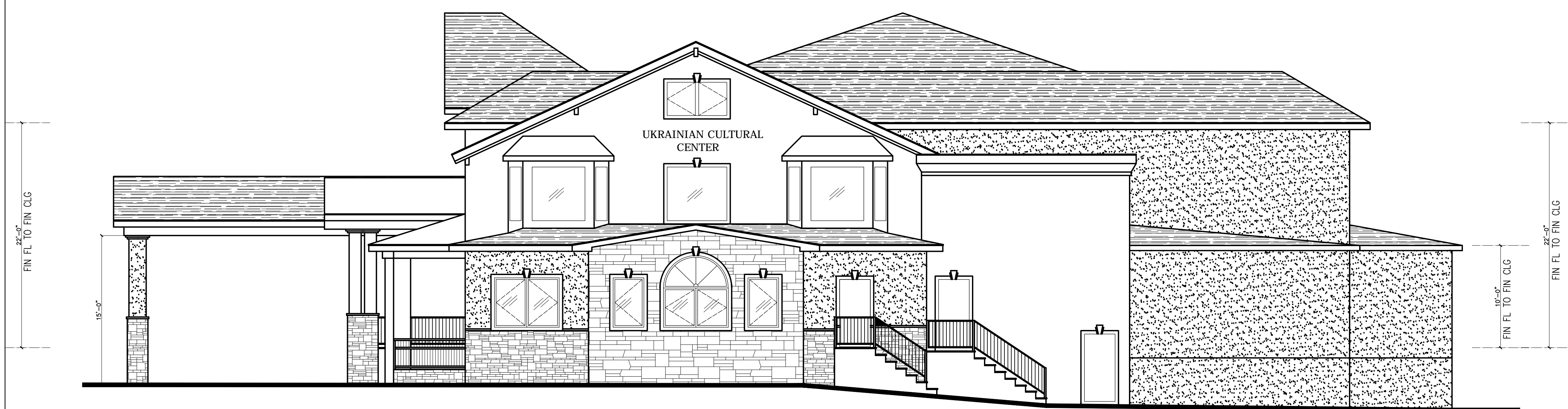
FRONT ELEVATION (ENTRY DRIVEWAY) SCALE: 5/32" = 1'-0"