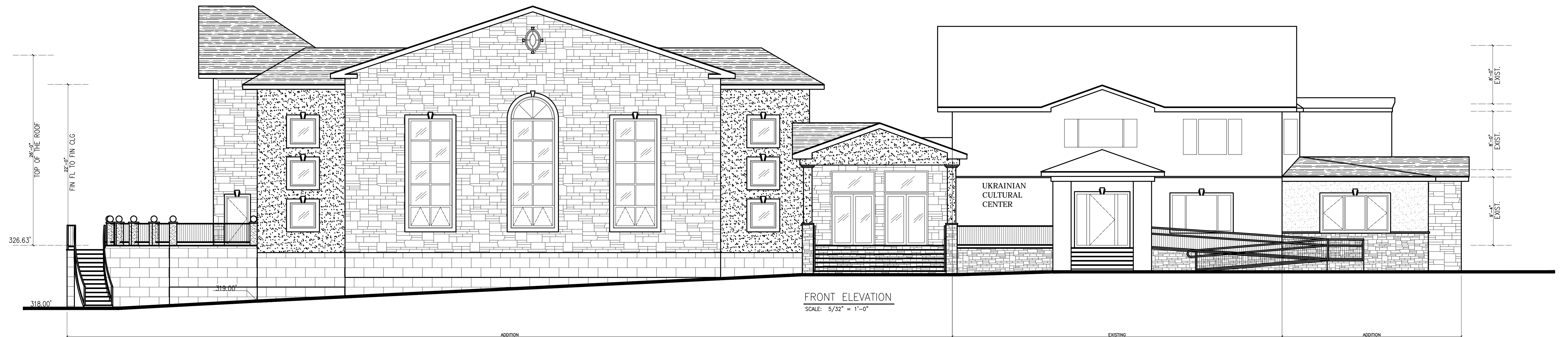
FRONT ELEVATION SCALE: 5/32" = 1'-0"